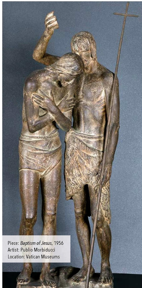
Piece: Baptism of Jesus, 1956 Artist: Publio Morbiducci Location: Vatican Museums

Am I courageous enough to ask the Holy Spirit to come down and touch my soul with his fire?