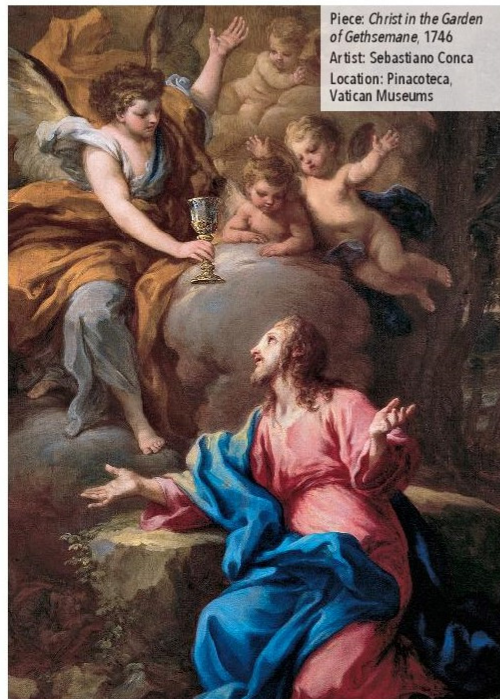
Piece: Christ in the Garden of Gethsemane , 1746 Artist: Sebastiano Conca Location: Pinacoteca, Vatican Museums

Gardens don't appear often in Scripture, but they are important. There is the Garden of Eden, the place of God's