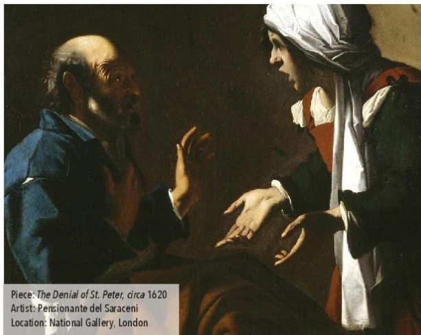
Piece: The Denial of St. Peter , circa 1620 Artist: Passignone del Saraceni Location: National Gallery, London