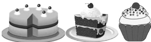
Lawn Party Dessert Table SOS

Orders to be prepared Saturday 4/27/ 2019 with pick-up between 2 and 4 pm. To Place an Order Contact: David Ladnier 251-375-4844 Or The Church Office 251-479-9885