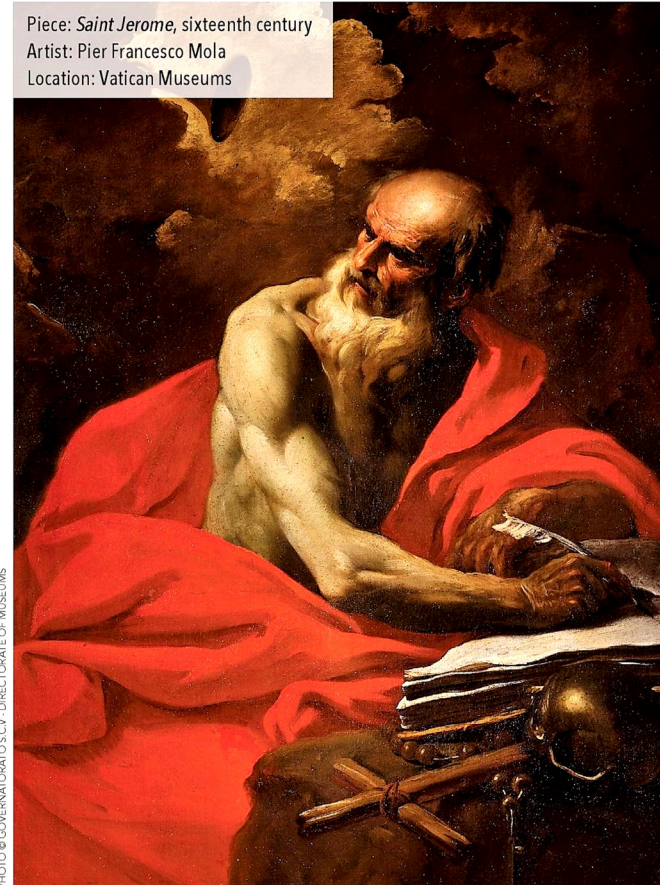
Piece: Saint Jerome , sixteenth century Artist: Pier Francesco Mola Location: Vatican Museums

For what profit comes to mortals from all the toil and anxiety of heart with which they toil under the sun?