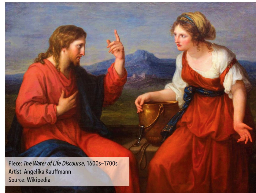
Piece: The Water of Life Discourse , 1600s-1700s Artist: Angelika Kauffmann