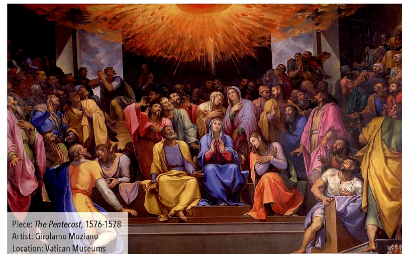
Piece: The Pentecost, 1576-1578 Artist: Girolamo Muziano Location: Vatican Museums

Jesus declared to the apostles at the Last Supper that the Holy Spirit would remind them of all he told them. Jesus gave this gift to the Church, and it's something we should value. How often do we do an internet search about a subject and then trust what a few articles say? Yet, are we as quick to look up what the Holy Father and the bishops say on different subjects in order to be guided by that light?