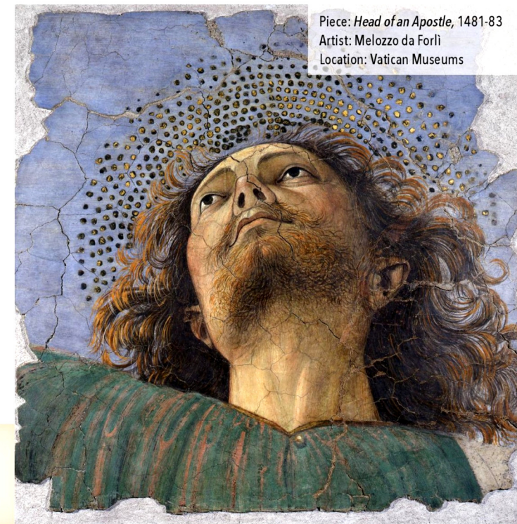
Piece: Head of an Apostle, 1481-83 Artist: Melozzo da Forlì Location: Vatican Museums