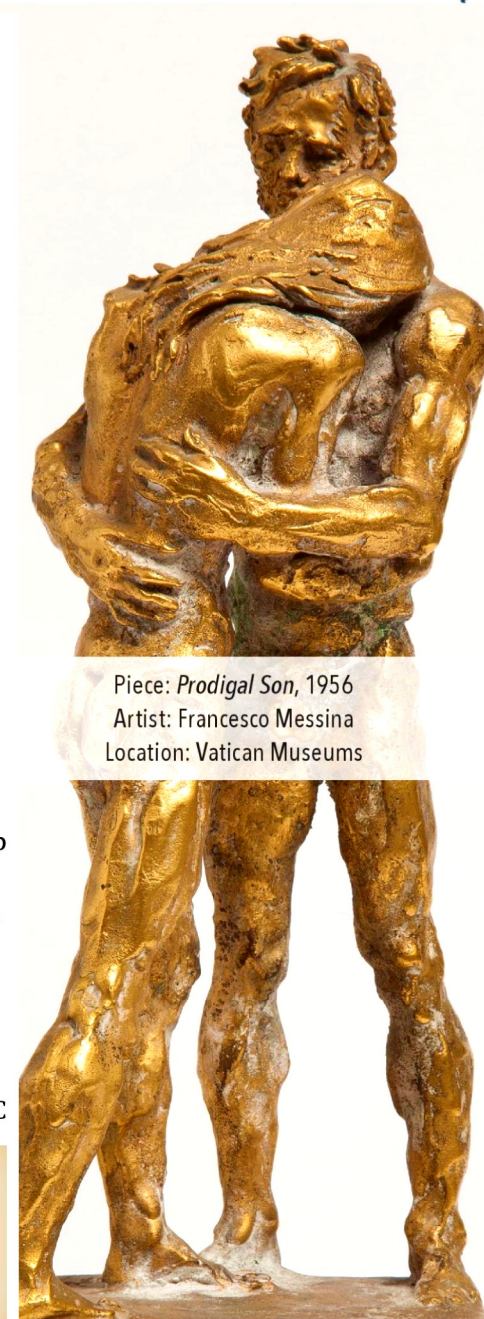
Piece: Prodigal Son, 1956 Artist: Francesco Messina Location: Vatican Museums

Do I live gospel charity and love with all its consequences?